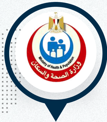
Ministry of Health and Population