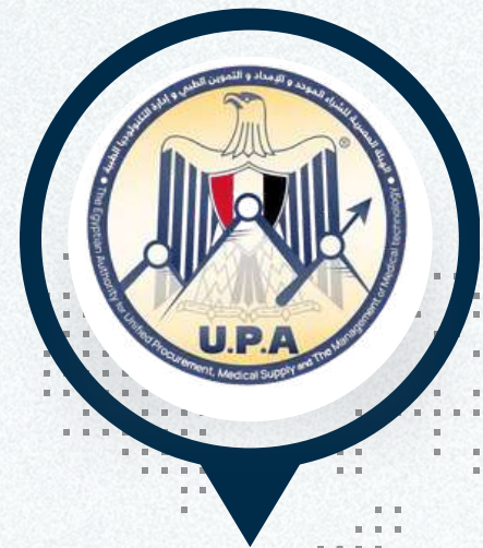
Unified Procurement Authority