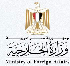
Ministry of Foreign Affairs